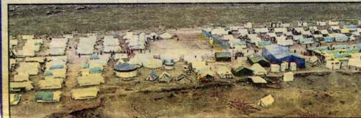
...tent village in Kashmir